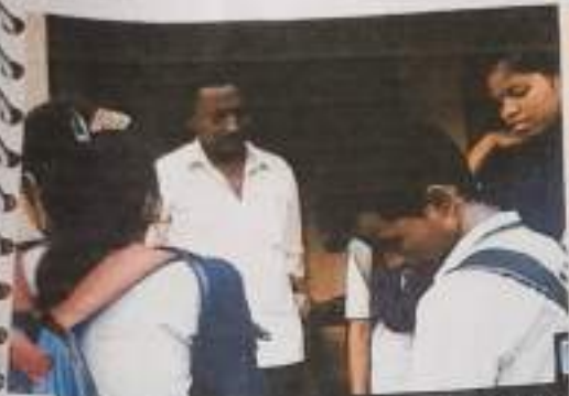
Visakhapatnam, Andhra Pradesh P72X+FHC, Jalaripeta, Port Area, Visakhapatnam, Andhra Pradesh 5 Lat 17.701186° Long 83.298853° 16/09/22 03:20 PM GMT +05:30