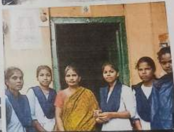
Visakhapatnam, Andhra Pradesh P72X+CFJ, Punjabi Hotel Rd, Burujupeta, Rao Peta, Port Area, Visakhapatnam, Andhra Pradesh 530001, India Lat 17.701088° Long 83.298575° 16/09/22 03:35 PM GMT +05:30