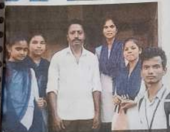
Visakhapatnam, Andhra Pradesh P72X+FHC, Jalaripeta, Port Area, Visakhapatnam, Andhra Pradesh 5 Lat 17.701186° Long 83.298853° 16/09/22 03:20 PM GMT +05:30