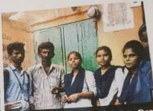
Visakhapatnam, Andhra Pradesh 21-42-1/2, Punjabi Hotel Rd, Chengal Rao Area, Visakhapatnam, Andhra Pradesh Lat 17.701179° Long 83.298526° 16/09/22 03:33 PM GMT +05:30